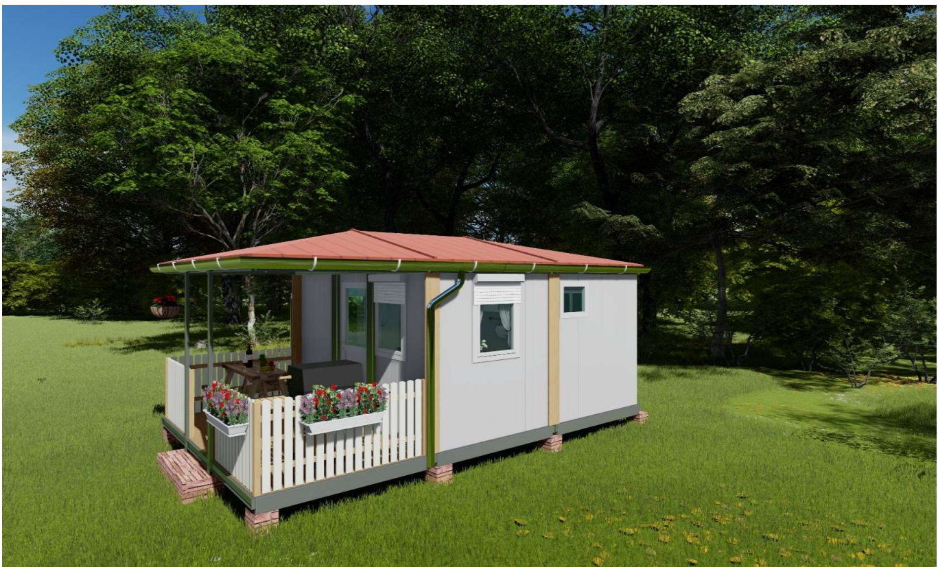
Cottages EBS Premijum

Video: youtube.com/watch?v=5o-WxVKqbUA&fe