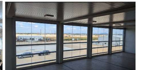
Expo Surcin 860pcs 2025